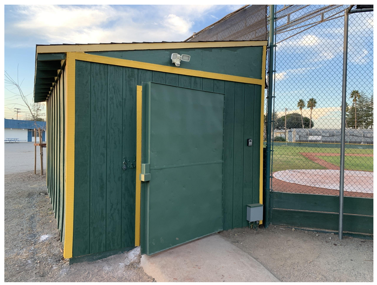
Major Shed Door Repairs